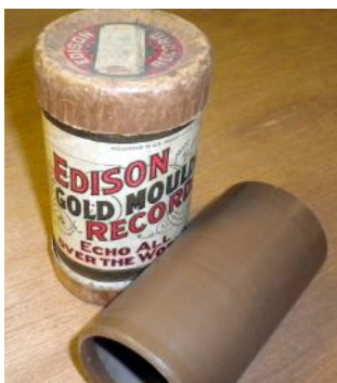
Edison cylinder record of “Aloha Oi” from family archives. Cost was 18 cents in 1908.

In 1893, there was a conspiracy to overthrow the indigenous and lawful government of Hawaii by the U.S. government. Queen Liliuokalani composed, then tearfully sang “Aloha Oi”, and publicly asked God to vindicate her people and set things right in her farewell address just before she stepped down from the throne on January 14.