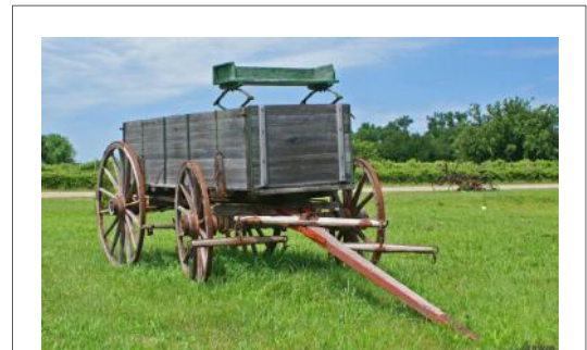
"Buckboard Wagon"

1 By the late 1860s communities had solemn Spring observances where people decorated the graves of those who died in the Civil War. Using the example of Southern States' picnics on the sacred battlegrounds as early as 1862, Union General Logan designated May 30, 1868, as the first yearly Decoration Day so everyone could commemorate the event together.