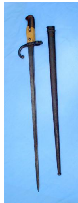
Bayonet and sheath, 1876.

So I took it ta the grindin’ wheel And set ta peddlin’ a real point ta it 2 Until it felt like mine until It felt like mine until it felt like Mine until I felt . 3