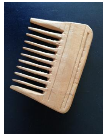
Whittled wooden comb used for wool.