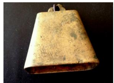
Hand-forged cow bell with wire and nut clapper.

Hunger-ravaged, weak, cold, near useless, Needin' battle gristle—bad—we come across a pasture; Someone shot at what moved ta our left: Lo and b'hold there was four milk cows, one down, The others soon dispatched.