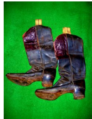
Great-great-grandfather Edwin's riding boots.

Ma legs danglin' in the chicken coop That same fine grey mornin' a Cacklin' hecklin' spirit Finally Got. My. Goat.